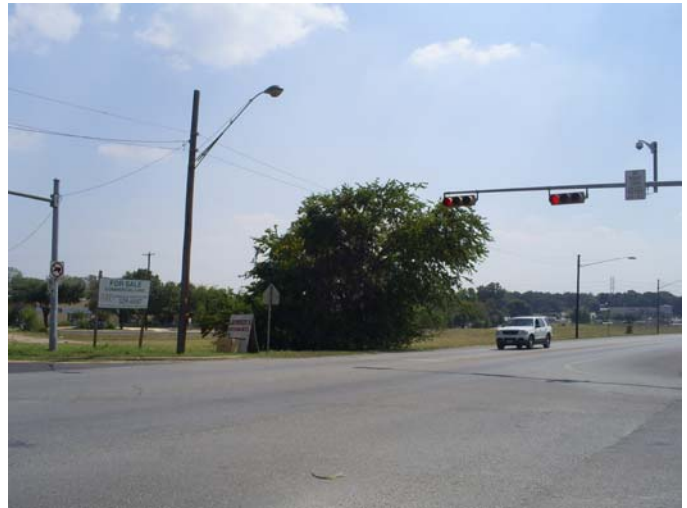
View of South Congress/Circle S/Eberhart Intersections