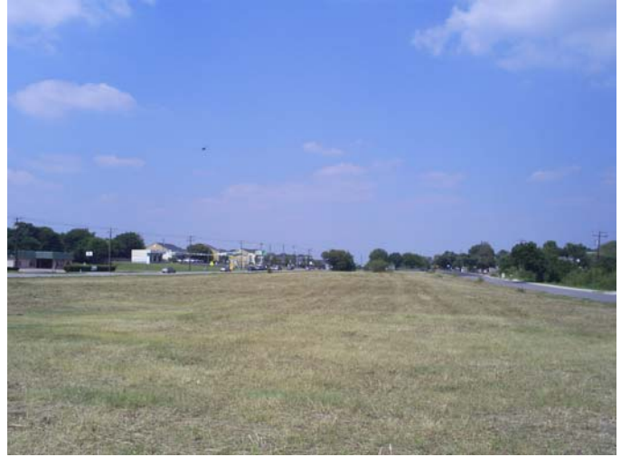
View North from South Property Line