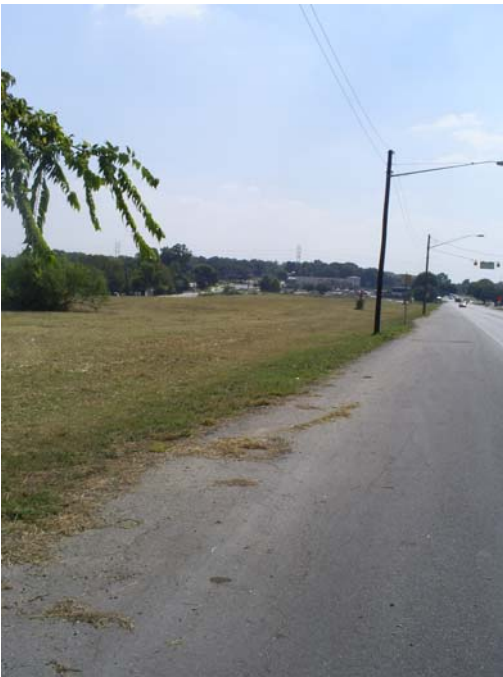
View South along South Congress