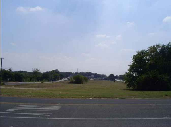
View South from Circle S Rd.